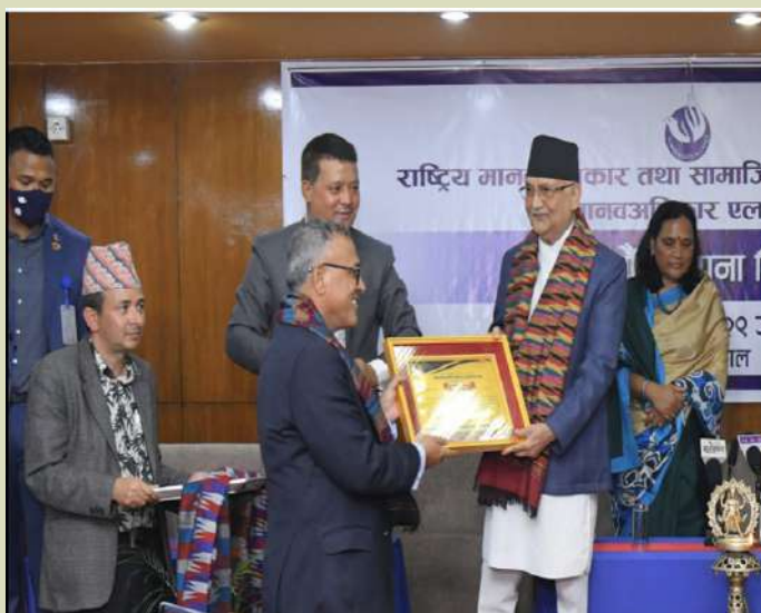
HRA Kathmandu, Bhaktapur and Lalitpur