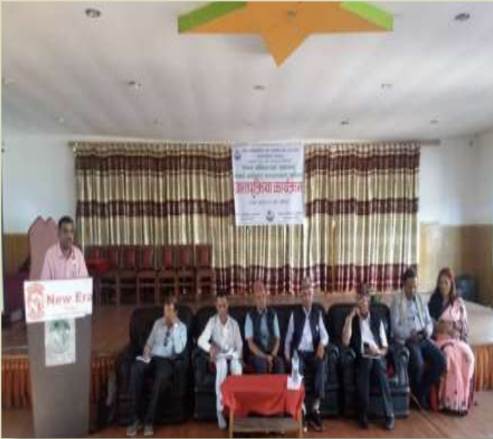
HRA Gandaki and Kaski